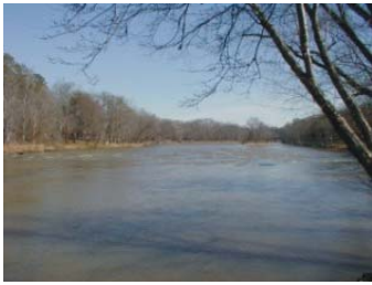
The Flint River!